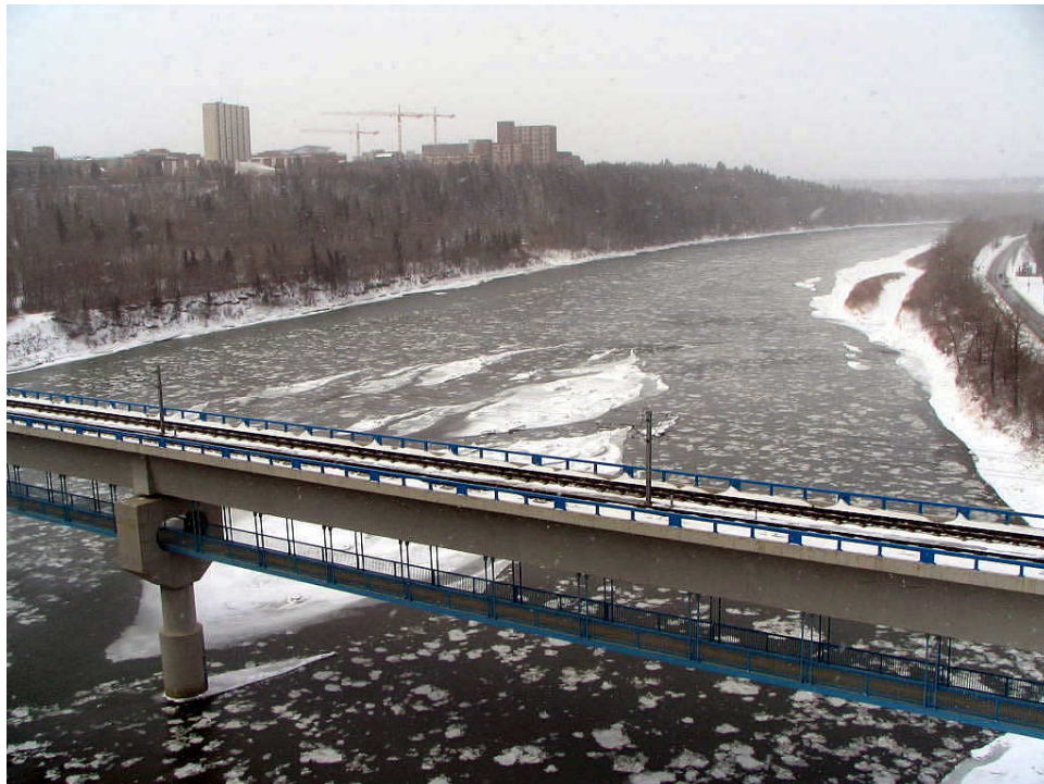
Photo 1: Looking upstream from the High Level Bridge. (22 April 2008)

Ice conditions on the North Saskatchewan River at Edmonton near KM 339.6 were documented by Alberta Environment on Tuesday, 22 April 2008. Photos of the river were taken from the High Level Bridge crossing looking both upstream and downstream. Unless changing river conditions warrant further documentation, no additional observation reports will be issued.