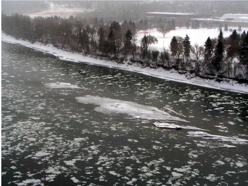
Photo 4: Looking downstream and towards the right bank. (22 April 2008)