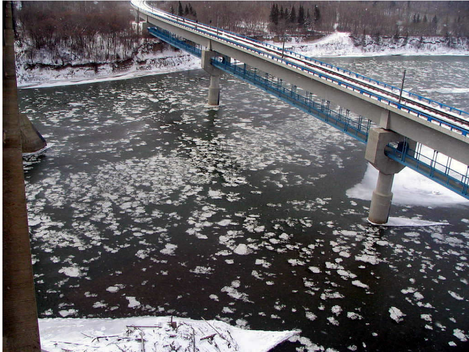
Photo 2: Looking upstream and towards the right bank. (22 April 2008)