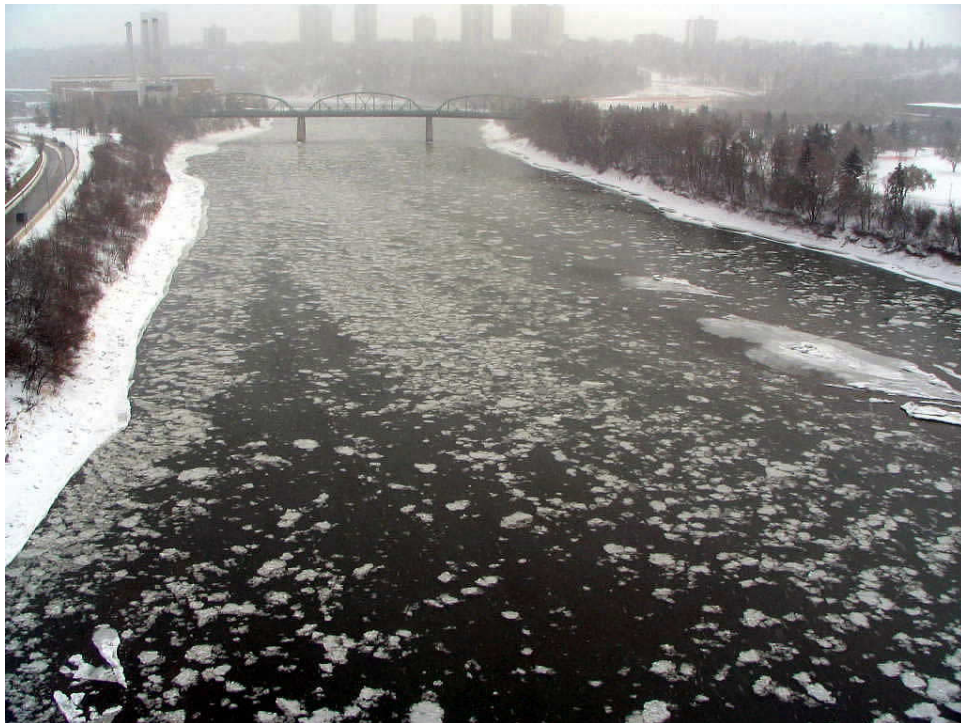
Photo 3: Looking downstream from the High Level Bridge. (22 April 2008)