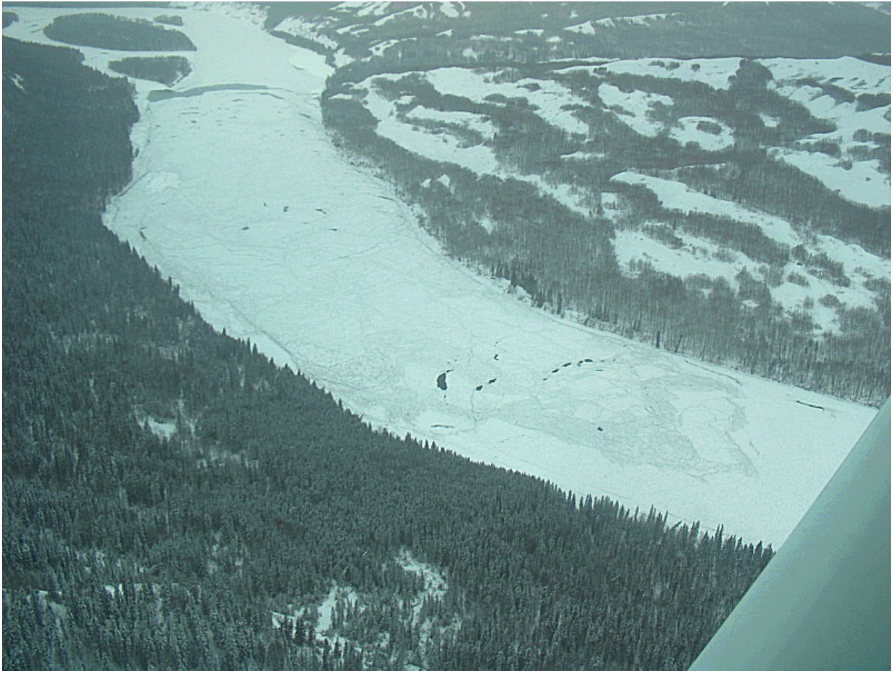
Toe of consolidation at km 223 (looking upstream).