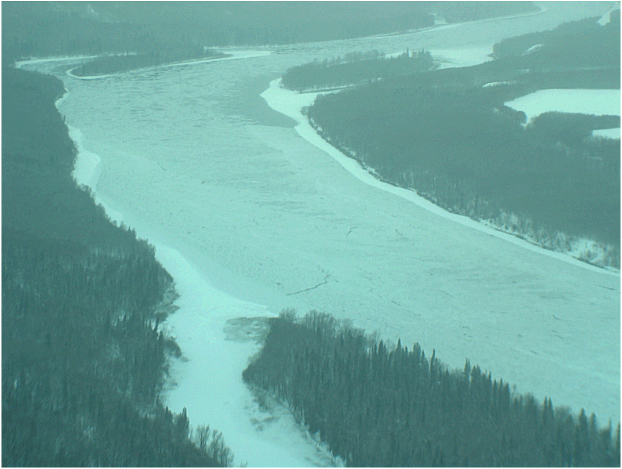
Ice front at km 212 (looking upstream).